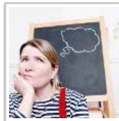
How To Feel Like An Asshole In Front Of Your Child's Teacher