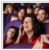
iParenting and the Loss of Social Etiquette