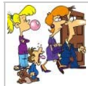
The Sitter Crisis