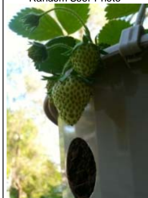
The Hawk Eye Blogs