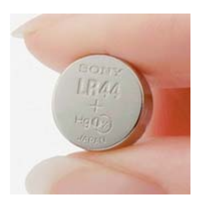
"Button batteries" used in an ever-increasing number of electronic devices pose a significant risk to children.

The researchers also found that nearly 72% of the battery-swallowing incidents involved children younger than age five, with the battery type reported in 69% of the cases, of which 58% involved button batteries and 11% cylindrical batteries.