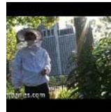
Watch: Apirian appreciation in the Big Apple