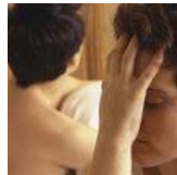
Why women lose interest in sex