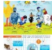
Mother Nature's Pop Science Guide to Birds, Part 3 [Infographic]