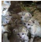
Rare sand cat kittens born in Israel