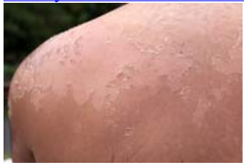
8 Strange Signs You're Having an Allergic Reaction