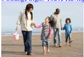
The Old Drug Talk: 7 New Tips for Today's Parents