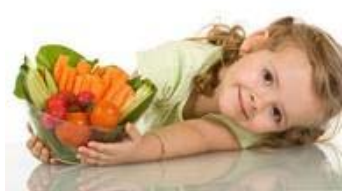
10 Ways to Promote Kids' Healthy Eating Habits