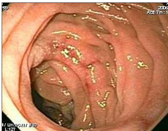
Figure 2) Endoscopy showing mild erosions in the duodenum

hydrogen peroxide (1,2). A concentration of 35% is technical grade or food grade hydrogen peroxide, and can be purchased in many health food stores because it is reputed to have multiple health benefits including being useful in the treatment of HIV, cancer, chronic obstructive pulmonary disease and Alzheimer's dementia (3). Higher concentrations of up to 90% are used as rocket fuel.