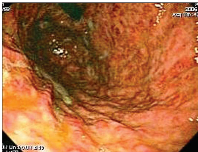
Figure 1) Endoscopy revealing grade 2 diffuse caustic mucosal injury involving the entire stomach including the cardia seen on retroflexion after ingestion of 250 mL of 35% hydrogen peroxide