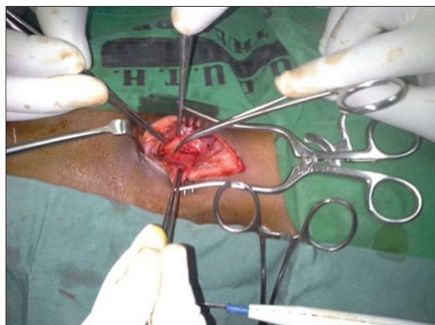
Figure 2: Exposed tracheo-esophageal fistula